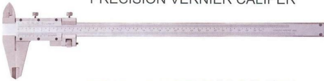
PRECISION VERNIER CALIPER