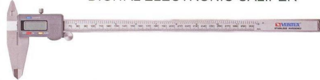
DIGITAL ELECTRONIC CALIPER